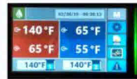
COLOR TOUCH SCREEN